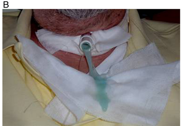
Figure 1 Methylene blue swallowing assessment. A. Oral administration of methylene blue. B. Appearance of blue colored secretions from tracheostomy in a dysphagic patient.

are carried out following verbal instructions and/or by imitation; if the patient has trouble with the voluntary performance of movements that on the contrary are carried out correctly automatically or as a reflex, the presence of buccofacial apraxia can be supposed.